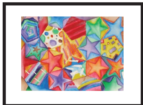
Honorable Mention Sami Stark